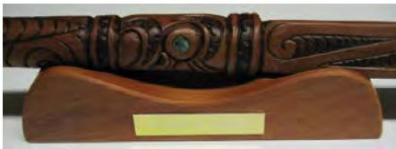
Showing stand with a plaque