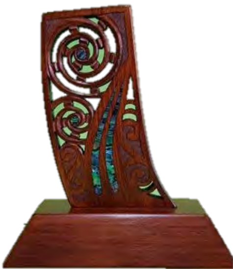
C0118 and C0119