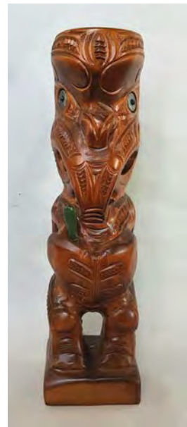
C0685 Teko Teko