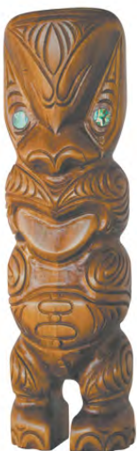
C0301 Teko Teko

Thank you for supporting New Zealand made products.