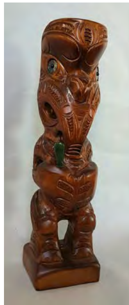
C0685 Teko Teko