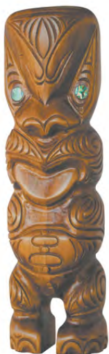
C0301 Teko Teko

Thank you for supporting New Zealand made products.