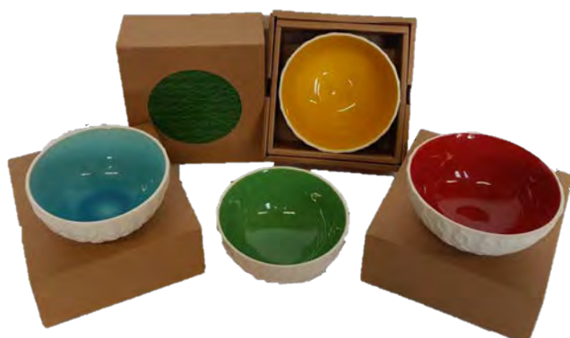
C0752B C0752G C0752Y C0752R

ALL PRICES ARE IN NZ$ AND EXCLUDE GST AND FREIGHT