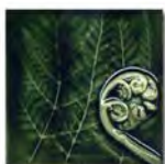
Ferns and Ponga

C7137 Square Plate 14.5sqcm $ 49.00 in MADINZ Presentation Box