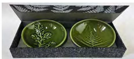
C0987D Totara and Silver Fern