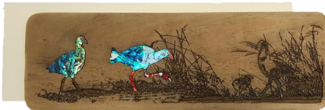
PU – Pukeko