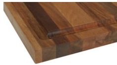
Showing the gravy groove