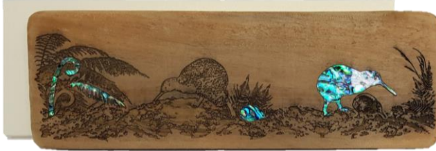
KI - Kiwi

ALL PRICES ARE IN NZ$ AND EXCLUDE GST AND FREIGHT